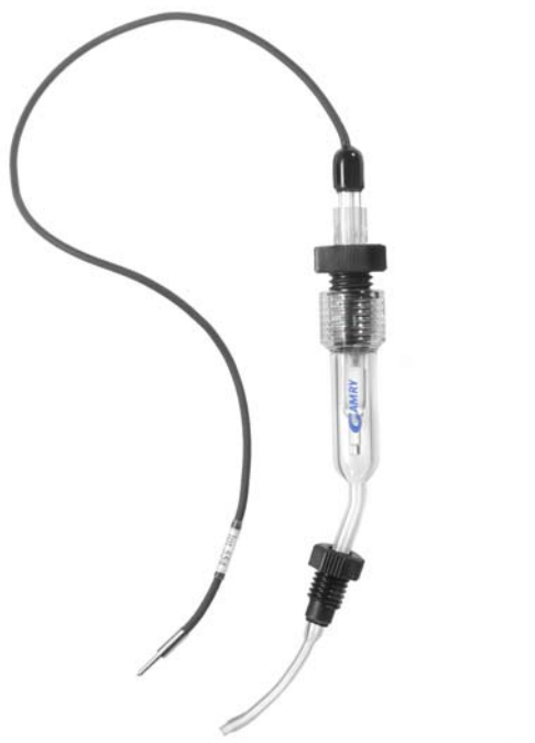
Figure 5. Reference Electrode Bridge Tube

EuroCell does not include a reference electrode, because different tests may call for different reference electrode types. The reference electrode shown in Figure 5 is Gamry's standard saturated calomel reference electrode (SCE) P/N 930-03. Gamry also offers an Ag/AgCl Reference (P/N 930-15) and a Hg/Hg 2 SO 4 reference (P/N 930-29). Contact your local Gamry sales representative if you need a new or a replacement electrode.