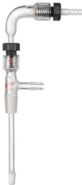
Figure 3. Gas Bubbler Assembly

Figure 3, is representative of the Gas Bubbler used for purge only (no blanketing). A plastic hose barb is shown connected to the Gas Bubbler Tube using the ACE-Thred To Hose adapter. The other end of this hose is connected to a source of purge gas.