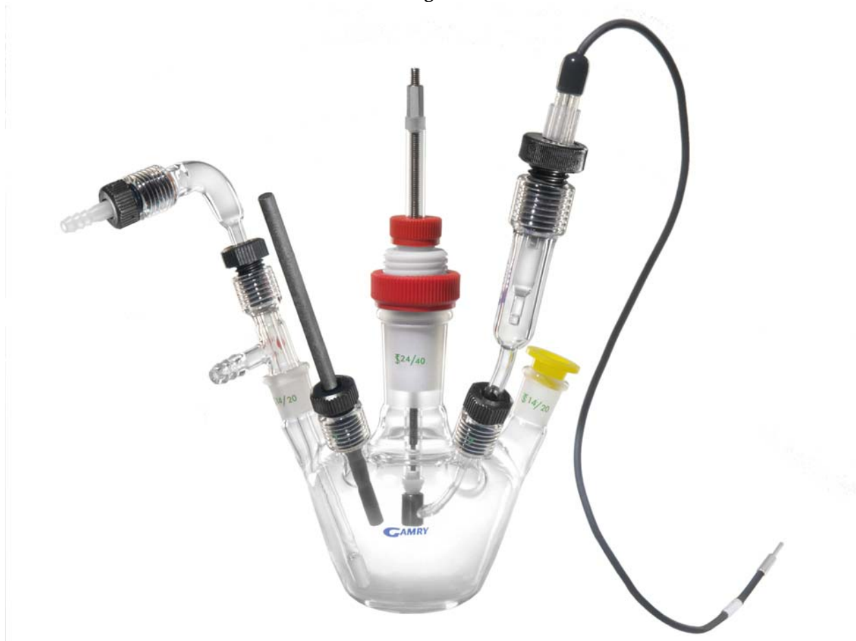
Figure 1 The Standard Configuration of a EuroCell

You should pay careful attention to cell cleanliness. In most electrochemical testing situations, contaminants in the cell and test solution can lead to poorly reproducible results.