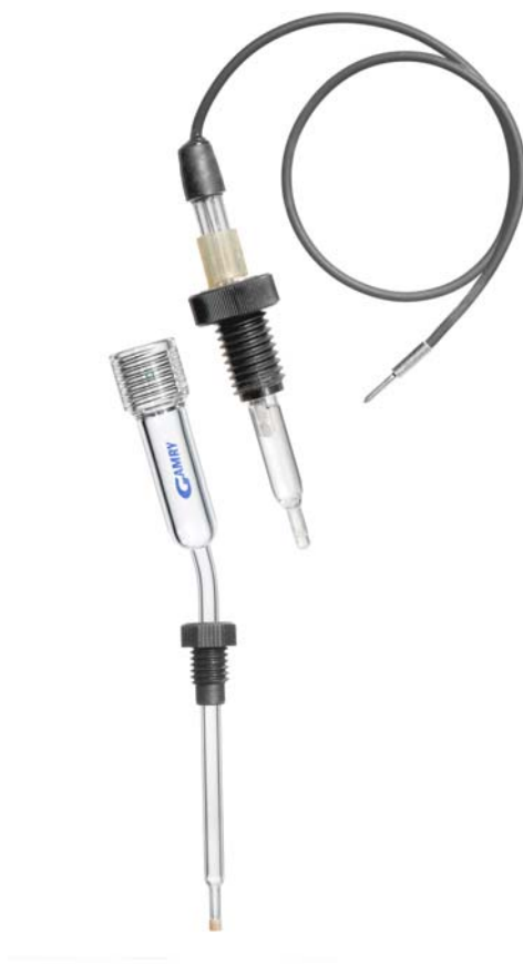
Figure 5. Bridge Tube and Reference Electrode Assembly

Dr. Bob's Cell can be used with 3 rd party reference electrodes, as long as the reference electrode diameter is between 9 and 10.5 mm.