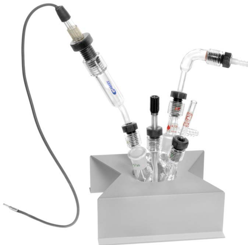
Figure 1 The Standard Configuration of Dr. Bob's Cell

You should pay careful attention to cell cleanliness. In most electrochemical testing situations, contaminants in the cell and test solution can lead to poorly reproducible results.