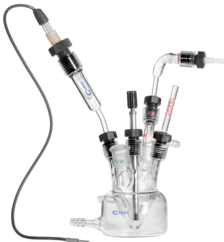
Figure 2 Picture of Jacketed Dr Bob's Cell Configuration

A given ACE-Thred size can only accommodate specific diameter objects. A #7 ACE-Thred is specified to work with object with a diameter between 6.5 mm and 7.5 mm. If you need to add non-standard options to your Dr. Bob's Cell kit, make sure you are aware of this restriction.