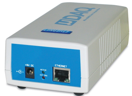
Figure 1 NET 24A

All Ethernet \mu DAQ devices ship with the EDR Enhanced Software Development kit containing the EDR Enhanced Application Program Interface (API). The EDR Enhanced API implements a standard function set ensuring that all functionality stays the same for different bus types. This allows for switching between Ethernet and other bus topologies, like USB, without any software change. It also makes it possible to use Ethernet technology without any knowledge of TCP/IP network programming.