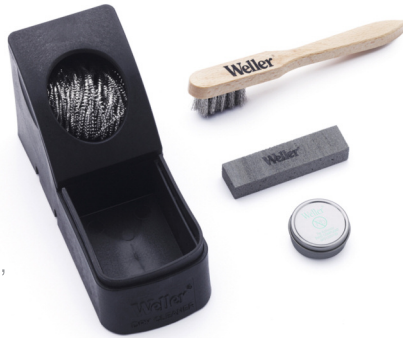
Cleaning Set with WDC, Stainless Steel Brush, Polishing Bar and Tip Activator