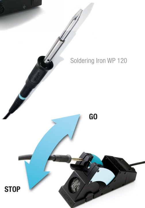
Weller Stop + Go Safety Rest with automatic Temperature Reduction