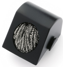
Dry Cleaner WDC 2