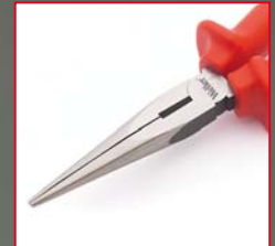
LNP200 Long Nose Pliers