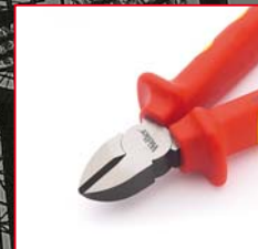
DCN160 Diagonal Cutting Nipper