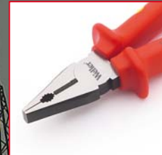
CP180 Combination Pliers