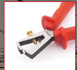
WS160 Wire Stripper