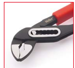
TGP250 Tongue & Groove Pliers