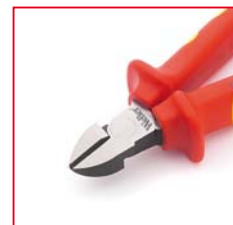
HLDN160 High Leverage Diagonal Cutting Nipper