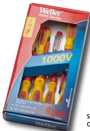
Screwdriver Set 8 pieces Code No. SD8SET